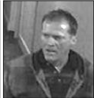
Niagara Regional Police