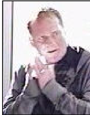
Waterloo Regional Police