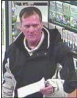
Toronto Police Service

Frauds/Robberies Targeting Senior Citizens